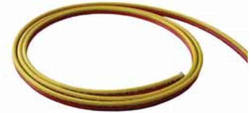
Also available PAA090 Thermoplastic Double Hose